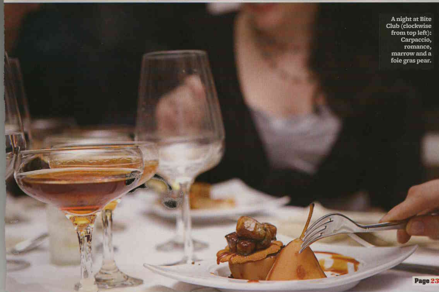
A night at Bite Club (clockwise from top left): Carpaccio, romance, marrow and a foie gras pear.